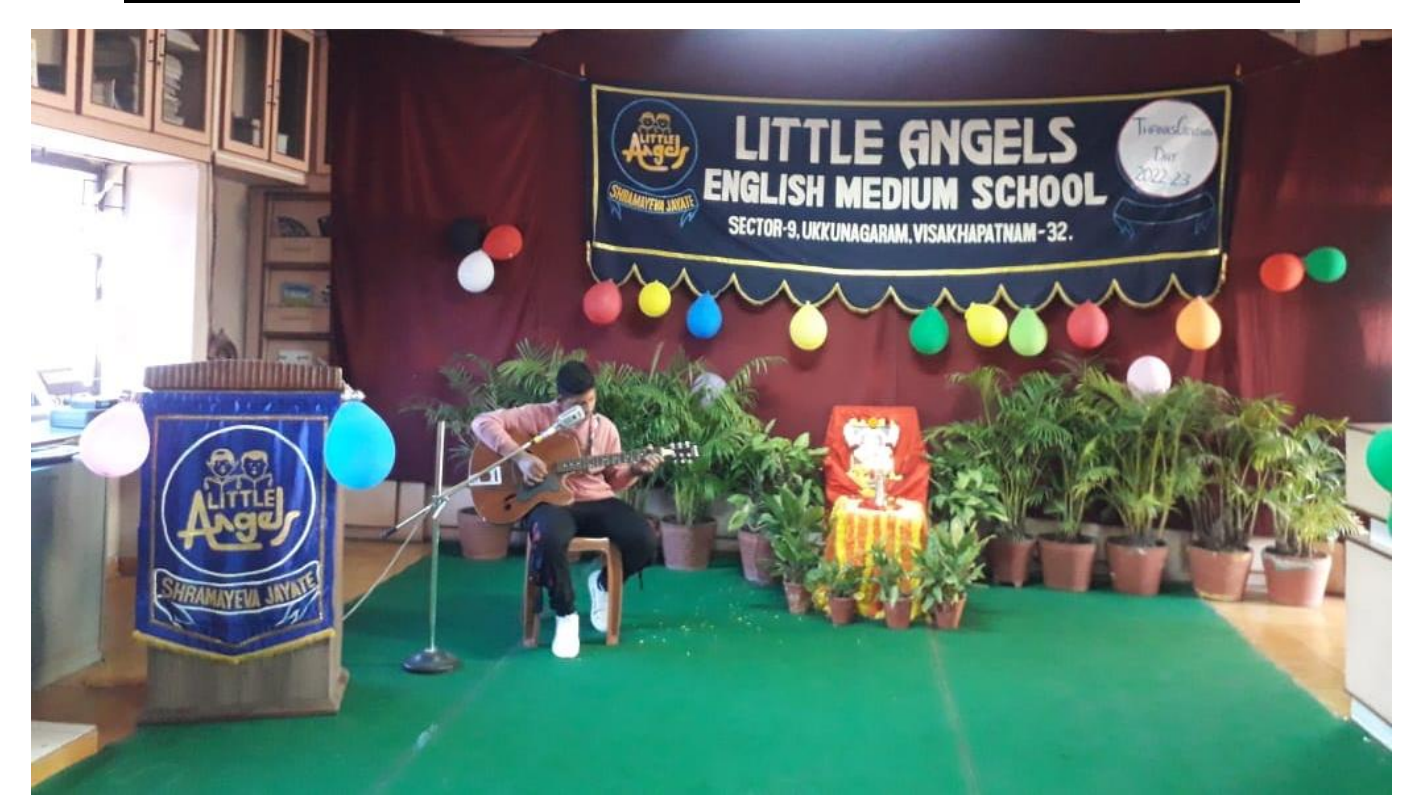
Student expressing her gratitude