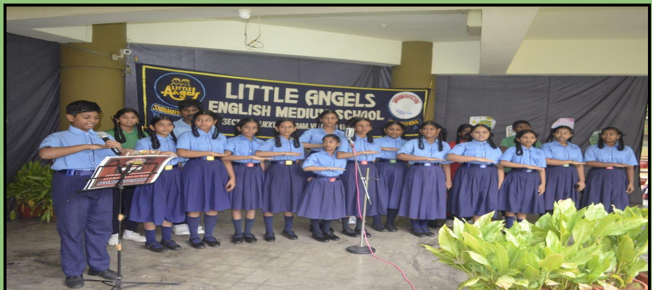
The programme was followed by a conversation on the importance of plantation by the students of class 9.